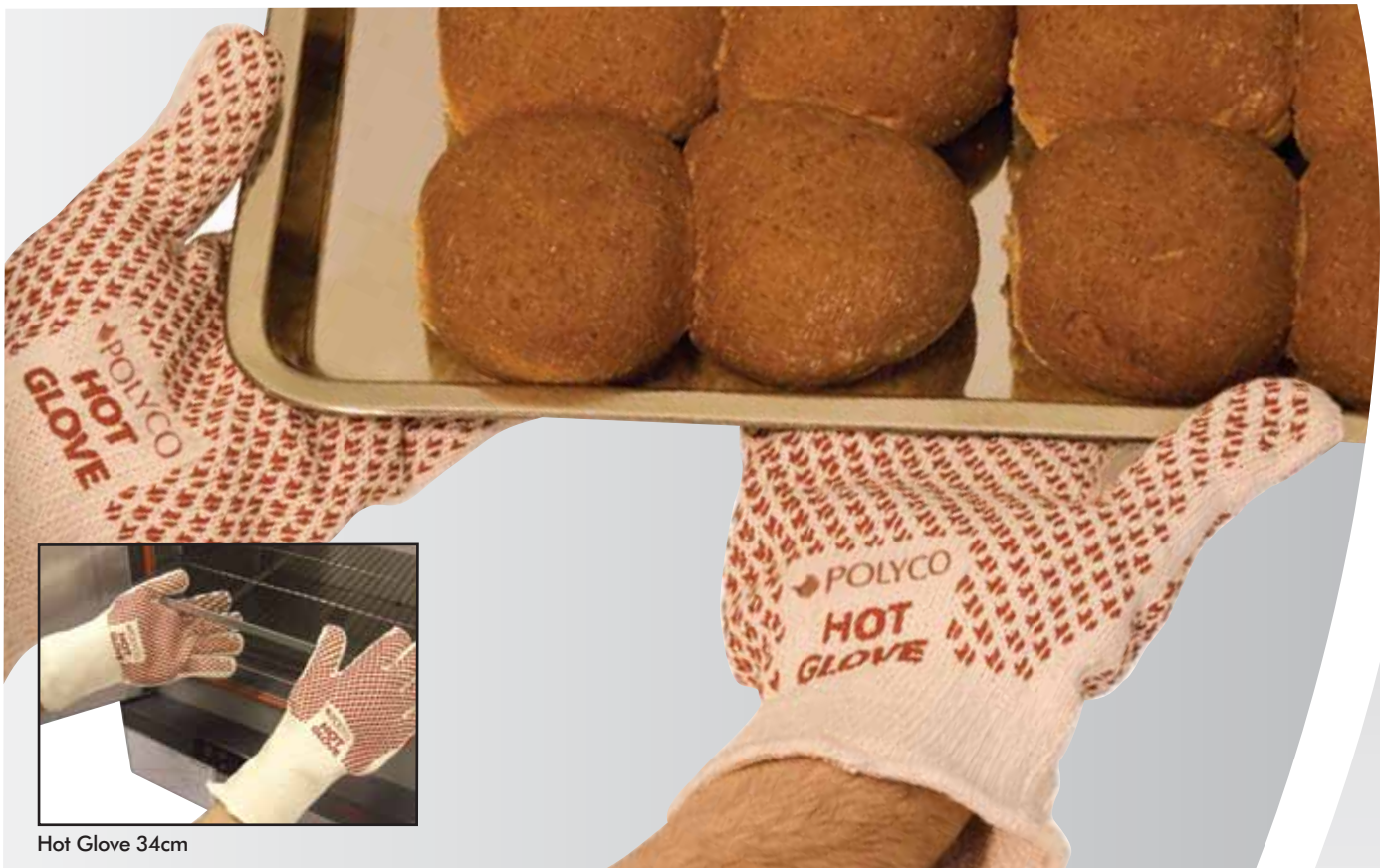
Hot Glove 34cm

Achieving level 2 for contact heat, it can withstand temperatures of 250°C providing a high level of protection against heat. The double layer of knitted cotton also offers a degree of comfort, flexibility and dexterity not normally associated with such protection levels. The glove has good tear resistance which enhances its mechanical protection and increases durability, and has a nitrile grip pattern for safer handling. It can be worn on either hand which extends the life of the glove, and is designed to have a generous fit to allow for quick and easy removal when required. Available in two lengths, for additional protection to the forearm.