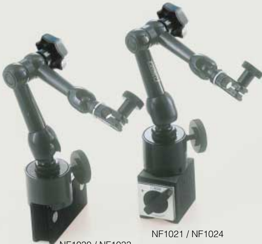
NF1030 / NF1033