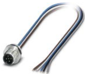
Sensor/actuator flush-type plug, 5-pos., M12, A-coded, front/screw mounting with Pg9 thread, with 0.5 m TPE litz wire, 5 x 0.34 mm 2 , stainless steel version

Please be informed that the data shown in this PDF Document is generated from our Online Catalog. Please find the complete data in the user's documentation. Our General Terms of Use for Downloads are valid ( http://download.phoenixcontact.com )