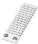
Marker card, Card, white, labeled, Horizontal: Consecutive numbers 1 - 10, 11 - 20, etc. up to 91 - 99, Mounting type: Adhesive, for terminal block width: 2.54 mm, Lettering field: 2.54 x 2.8 mm

Marker card - SK 2,54/2,8:FORTL.ZAHLEN - 0804853