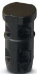
Filler plug, for CES-...-11 sleeves

Please be informed that the data shown in this PDF Document is generated from our Online Catalog. Please find the complete data in the user's documentation. Our General Terms of Use for Downloads are valid ( http://download.phoenixcontact.com )