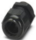
Cable gland, Cable gland material: Polyamide 6, External cable diameter 11 mm ... 17 mm, Shielding: No, Connecting thread: M25, Color: jet black

Cable gland - G-INS-M25-M68N-PNES-BK - 1411134