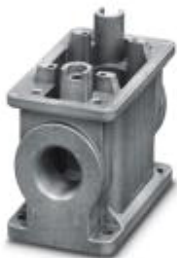
HEAVYCON ADVANCE B6 box mounting base, for M6 screw locking, salt-water-resistant aluminum, with 2 x M25 thread, without surface coating

Please be informed that the data shown in this PDF Document is generated from our Online Catalog. Please find the complete data in the user's documentation. Our General Terms of Use for Downloads are valid ( http://phoenixcontact.com/download )