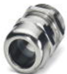
Cable gland, Cable gland material: Brass, nickel-plated, External cable diameter 11 mm ... 17 mm, Shielding: No, Connecting thread: M25, Color: silver

Cable gland - G-INS-M25-M68N-NNES-S - 1411165