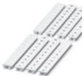
Zack marker strip, Strip, white, labeled, can be labeled with: Plotter, Printed horizontally: Consecutive numbers 1 - 10, 11 - 20, etc. up to 491 - 500, Mounting type: Snap into tall marker groove, for terminal block width: 8.2 mm, Lettering field: 10.5 x 8.15 mm

Zack marker strip - ZB 8,LGS:FORTL.ZAHLEN - 1052015