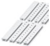
Zack marker strip, can be ordered: Strip, white, labeled according to customer specifications, Mounting type: Snap into tall marker groove, for terminal block width: 8.2 mm, Lettering field: 10.5 x 8.15 mm

Marker for terminal blocks - UC-TM 8 CUS - 0824597