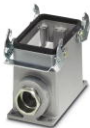
Box mounting base, for double locking latch, height 81 mm, with screw connection, 1x Pg21

Please be informed that the data shown in this PDF Document is generated from our Online Catalog. Please find the complete data in the user's documentation. Our General Terms of Use for Downloads are valid ( http://phoenixcontact.com/download )