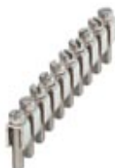
Fixed bridge, Number of positions: 10, Color: silver

Please be informed that the data shown in this PDF Document is generated from our Online Catalog. Please find the complete data in the user's documentation. Our General Terms of Use for Downloads are valid ( http://phoenixcontact.com/download )