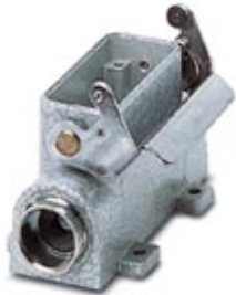
Box mounting base, with single locking latch, height 52 mm, with screw connection, 2x Pg16

Please be informed that the data shown in this PDF Document is generated from our Online Catalog. Please find the complete data in the user's documentation. Our General Terms of Use for Downloads are valid ( http://phoenixcontact.com/download )