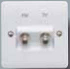
K3525 D1 WHI