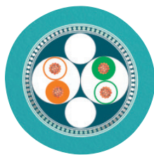
PUR ETHERNET 2x2 FLEX [93E]