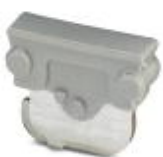
Feed-through connector, Length: 10.5 mm, Width: 4 mm, Color: gray

Feed-through connector - P-FIX - 3038956