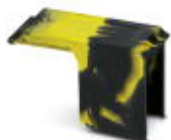
Covering hood, Connection method: Bolt connection, Width: 41 mm, Height: 33 mm, Color: black/yellow