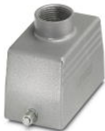
HEAVYCON sleeve housing B10, for single locking latch, height 45 mm, with support 1x M25, straight conductor exit

Please be informed that the data shown in this PDF Document is generated from our Online Catalog. Please find the complete data in the user's documentation. Our General Terms of Use for Downloads are valid ( http://download.phoenixcontact.com )