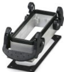
HEAVYCON panel mounting base HV10/16, with double locking latch, height 27 mm

Please be informed that the data shown in this PDF Document is generated from our Online Catalog. Please find the complete data in the user's documentation. Our General Terms of Use for Downloads are valid ( http://phoenixcontact.com/download )