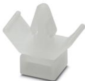
Image shows WT-R HF 4.8x200 version

Please be informed that the data shown in this PDF Document is generated from our Online Catalog. Please find the complete data in the user's documentation. Our General Terms of Use for Downloads are valid ( http://download.phoenixcontact.com )