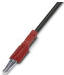
Test adapter, Color: red

Please be informed that the data shown in this PDF Document is generated from our Online Catalog. Please find the complete data in the user's documentation. Our General Terms of Use for Downloads are valid ( http://phoenixcontact.com/download )