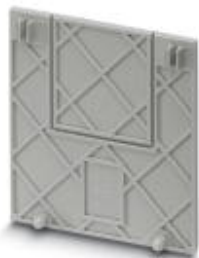
Separating plate, Length: 50 mm, Width: 1.5 mm, Color: gray

Please be informed that the data shown in this PDF Document is generated from our Online Catalog. Please find the complete data in the user's documentation. Our General Terms of Use for Downloads are valid ( http://phoenixcontact.com/download )