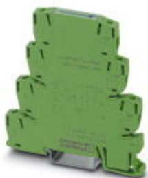
PLC solid-state relay with Push-in connection, for mounting on DIN rail NS 35/7.5, input: 24 V DC, output: TTL (5 V DC)

Please be informed that the data shown in this PDF Document is generated from our Online Catalog. Please find the complete data in the user's documentation. Our General Terms of Use for Downloads are valid ( http://download.phoenixcontact.com )