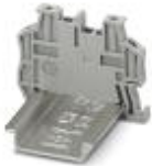
Quick mounting end clamp for NS 35/7,5 DIN rail or NS 35/15 DIN rail, with marking option, with parking option for FBS...5, FBS...6, KSS 5, KSS 6, width: 5.15 mm, color: gray