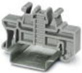
Quick mounting end clamp for NS 35/7,5 DIN rail or NS 35/15 DIN rail, with marking option, width: 9.5 mm, color: gray