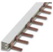
Insertion bridge, Number of positions: 56, Color: gray

Insertion bridge - EB 56-18/L1-L2-L3 - 3009367