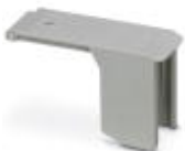
Covering hood, Connection method: Bolt connection, Width: 54.8 mm, Height: 33 mm, Color: gray