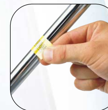
Rotate and repeat