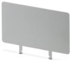
Partition plate, Length: 42.5 mm, Width: 2.5 mm, Height: 41 mm, Color: gray

Please be informed that the data shown in this PDF Document is generated from our Online Catalog. Please find the complete data in the user's documentation. Our General Terms of Use for Downloads are valid ( http://phoenixcontact.com/download )