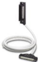
Assembled round cable with two molded 50-pos. socket strips (1:1 connection). Cable length: 1.0 m.

Please be informed that the data shown in this PDF Document is generated from our Online Catalog. Please find the complete data in the user's documentation. Our General Terms of Use for Downloads are valid ( http://phoenixcontact.com/download )