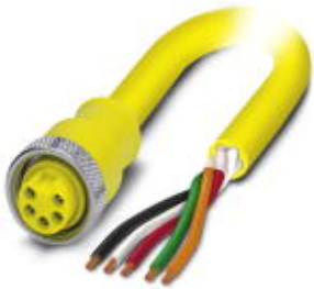
Sensor/Actuator cable, 5-position, PVC, Yellow RAL 1021, free cable end, on Socket straight 7/8"-16UNF, A-coded, Cable length: 6 m

Please be informed that the data shown in this PDF Document is generated from our Online Catalog. Please find the complete data in the user's documentation. Our General Terms of Use for Downloads are valid ( http://phoenixcontact.com/download )