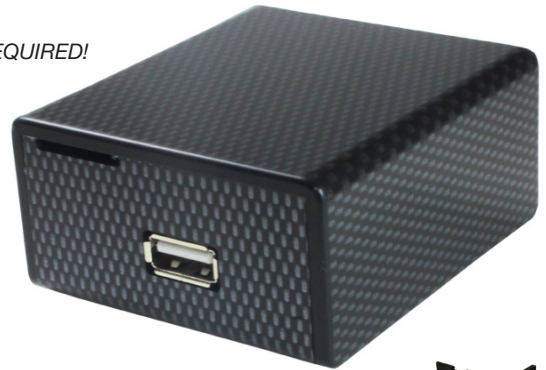
Raspberry Pi A+ not included