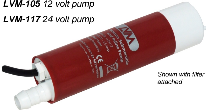
Shown with filter attached