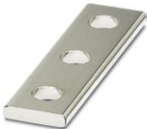
Connection element, Number of positions: 3, Color: silver

Please be informed that the data shown in this PDF Document is generated from our Online Catalog. Please find the complete data in the user's documentation. Our General Terms of Use for Downloads are valid ( http://phoenixcontact.com/download )