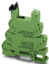
Figure shows PLC-BSC-120UC/21-21/SO46 version

14 mm PLC basic terminal blocks with spring-cage connection, 230 V AC/DC input voltage (without relay or optocoupler)