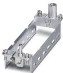
HEAVYCON hinged retaining frame, for HC-B 24 supporting base element, for 6 modules, labeling with lower case letters (a, b, c, etc.)

Please be informed that the data shown in this PDF Document is generated from our Online Catalog. Please find the complete data in the user's documentation. Our General Terms of Use for Downloads are valid ( http://download.phoenixcontact.com )