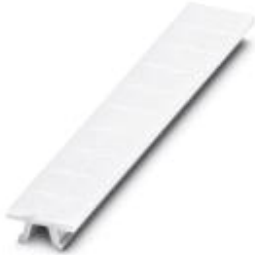
The illustration shows the version ZB 6:UNBEDRUCKT

Zack marker strip, 10-section, vertically labeled with the consecutive numbers: 191 ... 200, white, Width: 6 mm