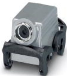
Sleeve housing, with double locking latch, height 48 mm, with screw connection, 1x Pg16, lateral cable entry

Please be informed that the data shown in this PDF Document is generated from our Online Catalog. Please find the complete data in the user's documentation. Our General Terms of Use for Downloads are valid ( http://phoenixcontact.com/download )