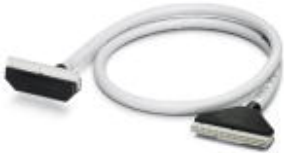
The figure shows the 50-pos. product version

Assembled round cable with two molded 40-pos. socket strips (1:1 connection). The cable has a 90° punched on connector and a 180° punched on connector, cable length: 1.5 m