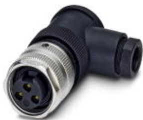
Sensor/actuator connector, female, angled, 3-pos., 7/8", screw connection, metal knurl, cable screw connection Pg9

Please be informed that the data shown in this PDF Document is generated from our Online Catalog. Please find the complete data in the user's documentation. Our General Terms of Use for Downloads are valid ( http://phoenixcontact.com/download )