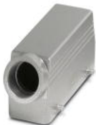
HEAVYCON sleeve housing B16, for double locking latch, height 60 mm, with support 1x M25, lateral conductor exit

Please be informed that the data shown in this PDF Document is generated from our Online Catalog. Please find the complete data in the user's documentation. Our General Terms of Use for Downloads are valid ( http://download.phoenixcontact.com )