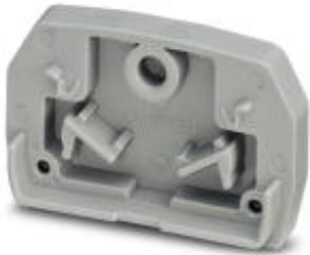
End cover, Length: 32 mm, Width: 4 mm, Color: gray

Please be informed that the data shown in this PDF Document is generated from our Online Catalog. Please find the complete data in the user's documentation. Our General Terms of Use for Downloads are valid ( http://phoenixcontact.com/download )