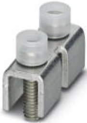
Fixed bridge, Number of positions: 2, Color: silver

Please be informed that the data shown in this PDF Document is generated from our Online Catalog. Please find the complete data in the user's documentation. Our General Terms of Use for Downloads are valid ( http://phoenixcontact.com/download )