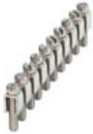
Fixed bridge, Number of positions: 10, Color: silver

Please be informed that the data shown in this PDF Document is generated from our Online Catalog. Please find the complete data in the user's documentation. Our General Terms of Use for Downloads are valid ( http://phoenixcontact.com/download )