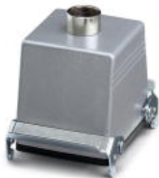
Coupling housing, with double locking latch, height: 82 mm, with gland, 1 x Pg29

Please be informed that the data shown in this PDF Document is generated from our Online Catalog. Please find the complete data in the user's documentation. Our General Terms of Use for Downloads are valid ( http://phoenixcontact.com/download )