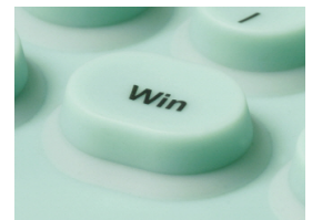
No Infection Traps