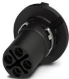
Flush-type connector, Universal, 4-position, SocketLink:straight, S power, PCB mounting, THR solder connection

Please be informed that the data shown in this PDF Document is generated from our Online Catalog. Please find the complete data in the user's documentation. Our General Terms of Use for Downloads are valid ( http://phoenixcontact.com/download )