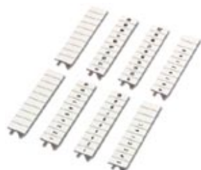
Zack marker strip, 10-section, horizontally labeled with the consecutive numbers: 231 ... 240, white, Width: 5 mm

Please be informed that the data shown in this PDF Document is generated from our Online Catalog. Please find the complete data in the user's documentation. Our General Terms of Use for Downloads are valid ( http://download.phoenixcontact.com )