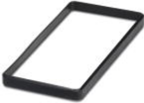
Profile gasket for ADVANCE housing HC-B10.....STA of B10 type

Please be informed that the data shown in this PDF Document is generated from our Online Catalog. Please find the complete data in the user's documentation. Our General Terms of Use for Downloads are valid ( http://phoenixcontact.com/download )