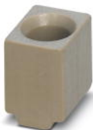
Bridge bar isolator

Please be informed that the data shown in this PDF Document is generated from our Online Catalog. Please find the complete data in the user's documentation. Our General Terms of Use for Downloads are valid ( http://phoenixcontact.com/download )