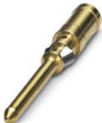
Turned 1.6 crimp contact, individual male contact, core diameter 0.75 mm 2 , gold-plated

Please be informed that the data shown in this PDF Document is generated from our Online Catalog. Please find the complete data in the user's documentation. Our General Terms of Use for Downloads are valid ( http://phoenixcontact.com/download )