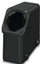
HEAVYCON EVO sleeve housing, plastic, with bayonet flange for EVO screw connection, B24, for double locking latch, height: 87.5 mm, without EVO screw connection

Please be informed that the data shown in this PDF Document is generated from our Online Catalog. Please find the complete data in the user's documentation. Our General Terms of Use for Downloads are valid ( http://phoenixcontact.com/download )