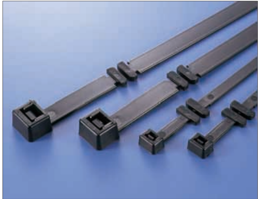
Cable tray ties in application.

The CTF Fixing Ties are designed specifically for use with cable tray.