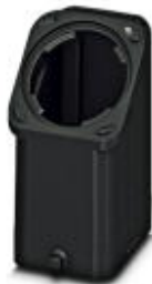
HEAVYCON EVO sleeve housing, plastic, with bayonet flange for EVO screw connection, B6, for single locking latch, height: 87.5 mm, without EVO screw connection

Please be informed that the data shown in this PDF Document is generated from our Online Catalog. Please find the complete data in the user's documentation. Our General Terms of Use for Downloads are valid ( http://phoenixcontact.com/download )