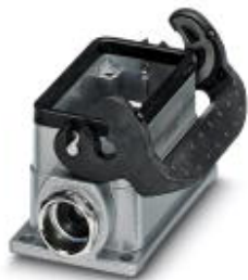
Box mounting base, with single locking latch, height 52 mm, with screw connection, 1x Pg16

Please be informed that the data shown in this PDF Document is generated from our Online Catalog. Please find the complete data in the user's documentation. Our General Terms of Use for Downloads are valid ( http://phoenixcontact.com/download )